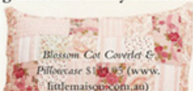
Blossom Cot Coverlet & Pillowcase $129.95 (www. littlemaison.com.au)