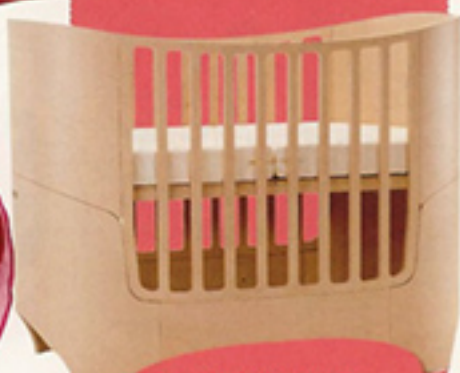
Leander Bed $1759.95 (www.danishbydesign. com.au)