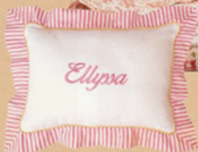
Baby Boudier Cushion $49.95 (www.bollyandbear.com.au)