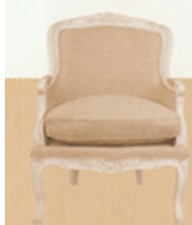
Vilouse Armchair $1400 (www. littlemaison.com.au)

With its soft French Provincial feel, and gorgeous musky pink tones, this special room is ensuring that some family heirlooms are being made each day.