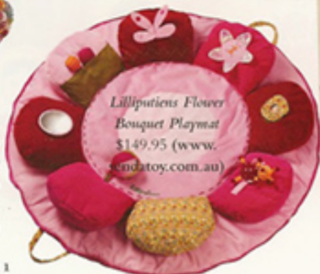
Lilliputiens Flower Bouquet Playmat $149.95 (www. sendatoy.com.au)