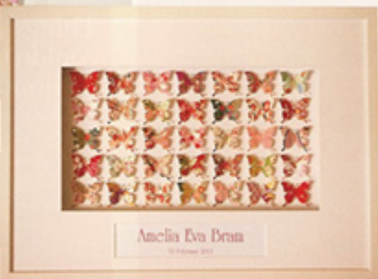
Framed personalised butterfly print $289 (www. lovepapersissors.com.au)