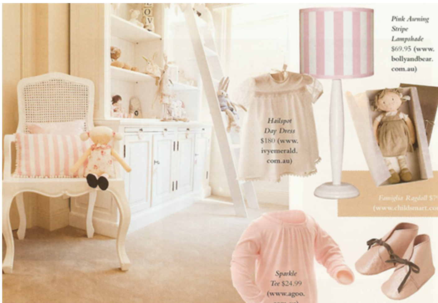
Pink Arming Stripe Lampshade $69.95 (www. bollyandbear. com.au)