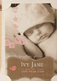
Personalised Birth Announcement Card From $2.20 each (www. hellobabydesigns. com.au)