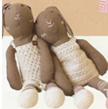
Cinnamon Linen Jane & Henry Rabbit $45 (www. andthelittledoglaughed.com)