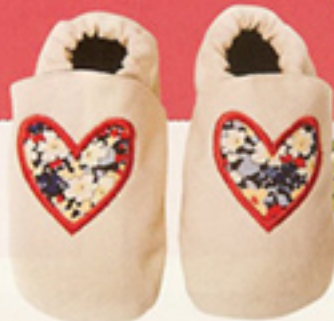
Limited edition fabric liberty love shoes $29.95 (www. cheekylittlesoles.com.au)