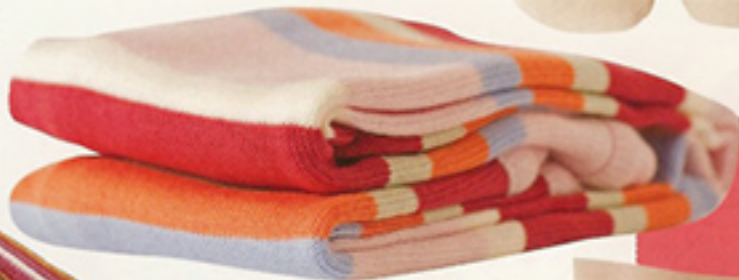
Little Girl Stripe cot blanket $149 (www. lambykins.com)