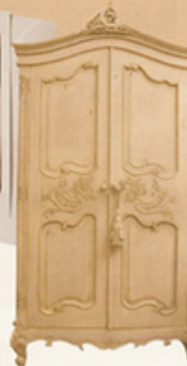
French Louis Style Armoire $1,999.00 (www. malmaison.com.au)