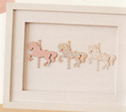
Merry Go Round print $129.95 (www. hugsandinspiration.com.au)