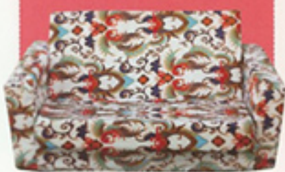
Aztec Baby Sofa $85 (Batik Baby - 0413 370 041)

Collecting stunning pieces in vibrant colours from all over the globe makes for an eclectic, yet perfect, little space for a gorgeous little girl.