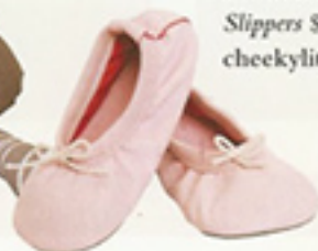
Ballerina Pink Ballet Slippers $35.95 (www. cheekylittlesoles.com.au)