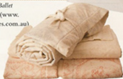
Cashmere Cot Blanket $340 (www.ivyemerald.com.au)