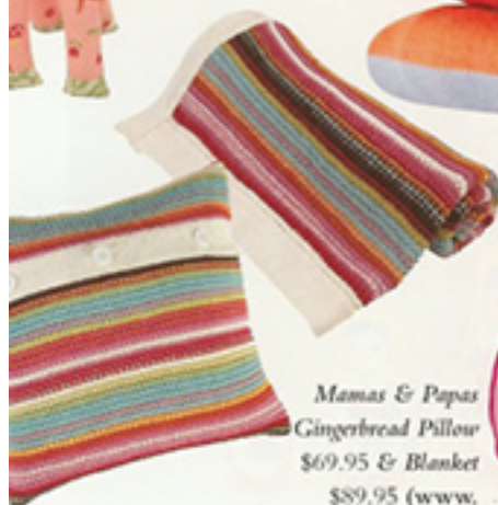
Mamas & Papas Gingerbread Pillow $69.95 & Blanket $89.95 (www. childsmart.com.au)