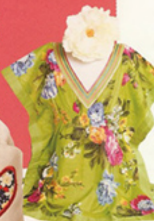
Moroccan Mint kaftan $27.5 (www.kaftankids.com.au)