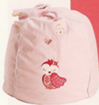
Dreamy Owl Bean Bag $99.95 (www.cocooncouture.com)